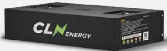
Golf Cart Battery