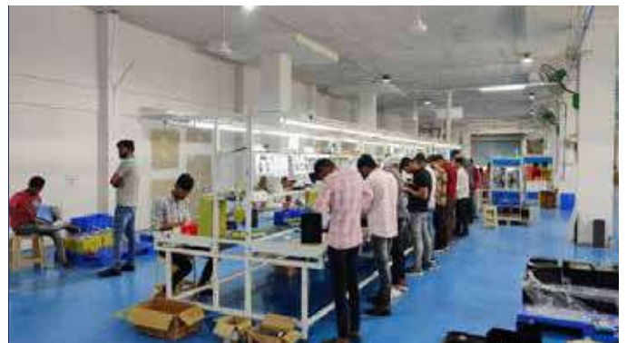
CLN Energy: Pune Plant