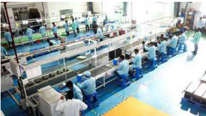
CLN Energy: Noida Plant