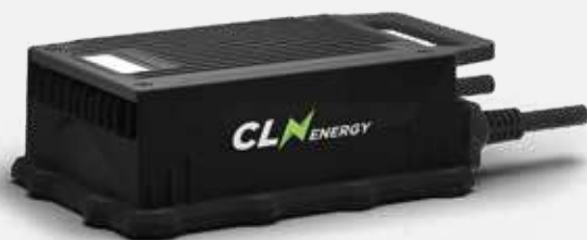
IP67 Rated Chargers