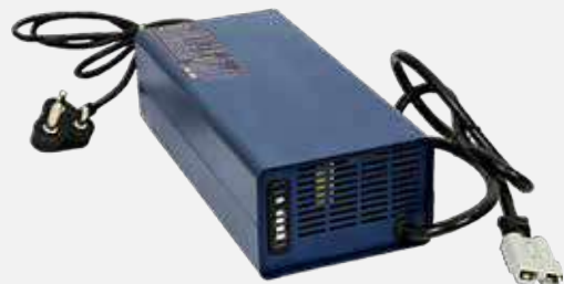
IP20 Rated Chargers